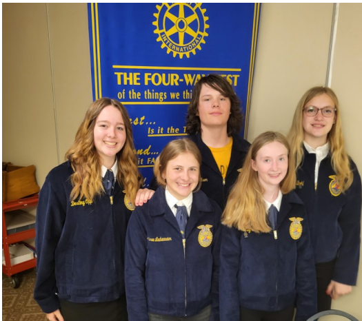
English youth in FFA speak at Jamestown Rotary on May 23, 2023