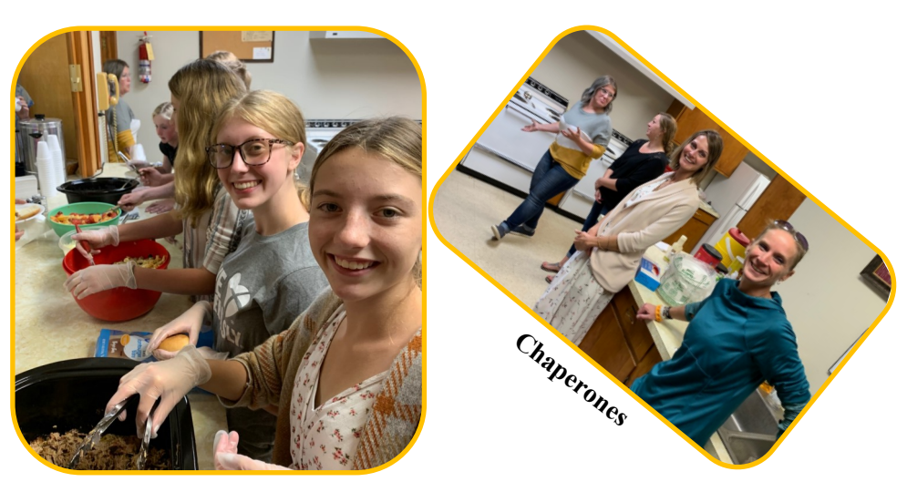
Serving the lunch @ the Medina Fall Festival after the worship service on September 12th.

Confirmation class on September 8, 2021. The lesson was on Communion. The students were able to share in Communion.